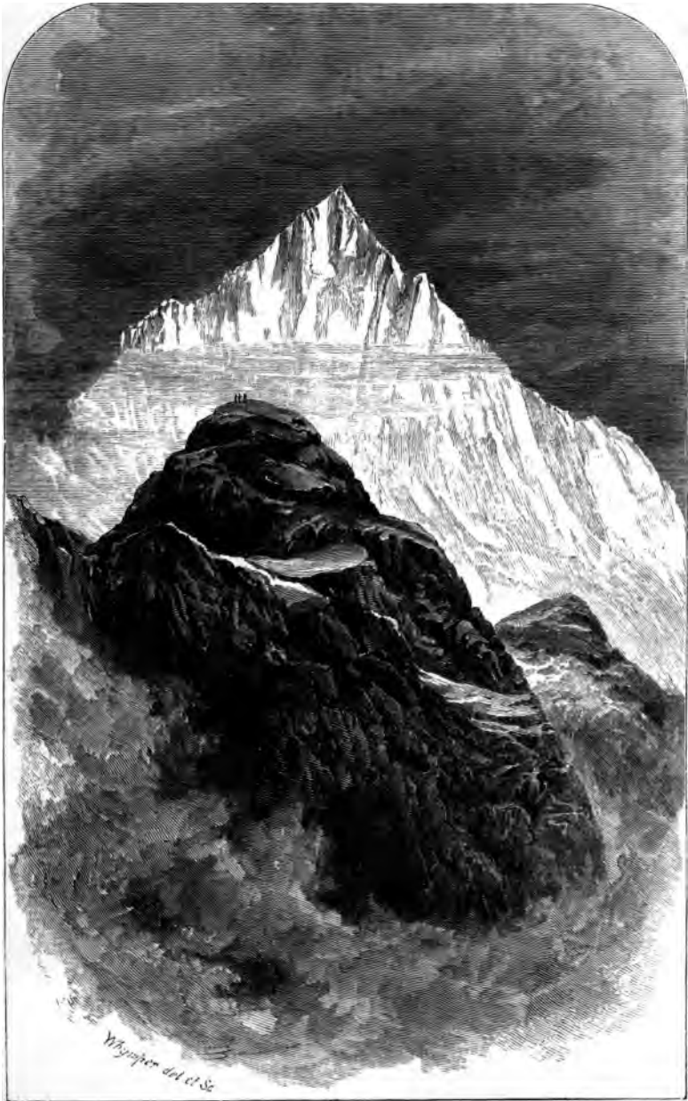
THE WEISSHORN FROM THE RIFFEL.